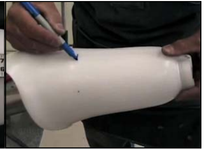
Transfer that measurement to the lateral anterior side of the socket. Make a horizontal line at the height of that measurement.