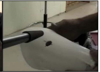
Make sure not to widen the hole more than necessary.