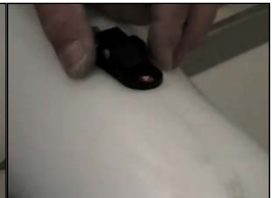
The lock is complete.