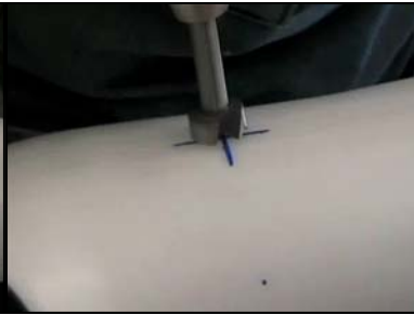
At the intersection drill a 3/4" hole.