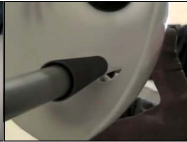
Taper the inside proximal edge and the outside distal edge of hole to help ease engagement.