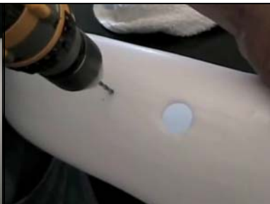
Drill a 5/32" hole at your mark for the attachment of the lock.