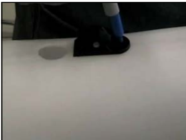
Set the lock in place approximately 1/4" below the hole. Mark the socket through the hole in the lock.