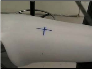
Draw a vertical line down the lateral anterior side, intersecting the horizontal line.