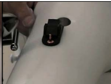
Attach lock with rivet and burr.